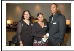
May 07 Ambassadors' Town Meeting Atlanta